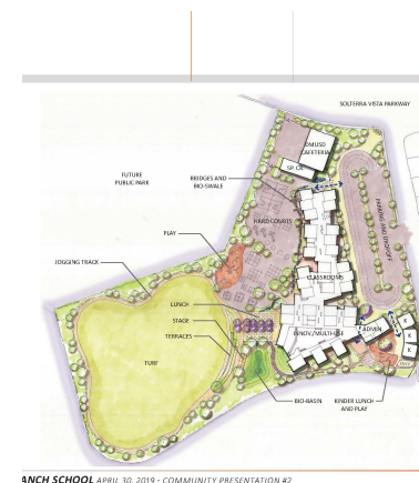
ANCH SCHOOL APRIL 30, 2019 - COMMUNITY PRESENTATION #2